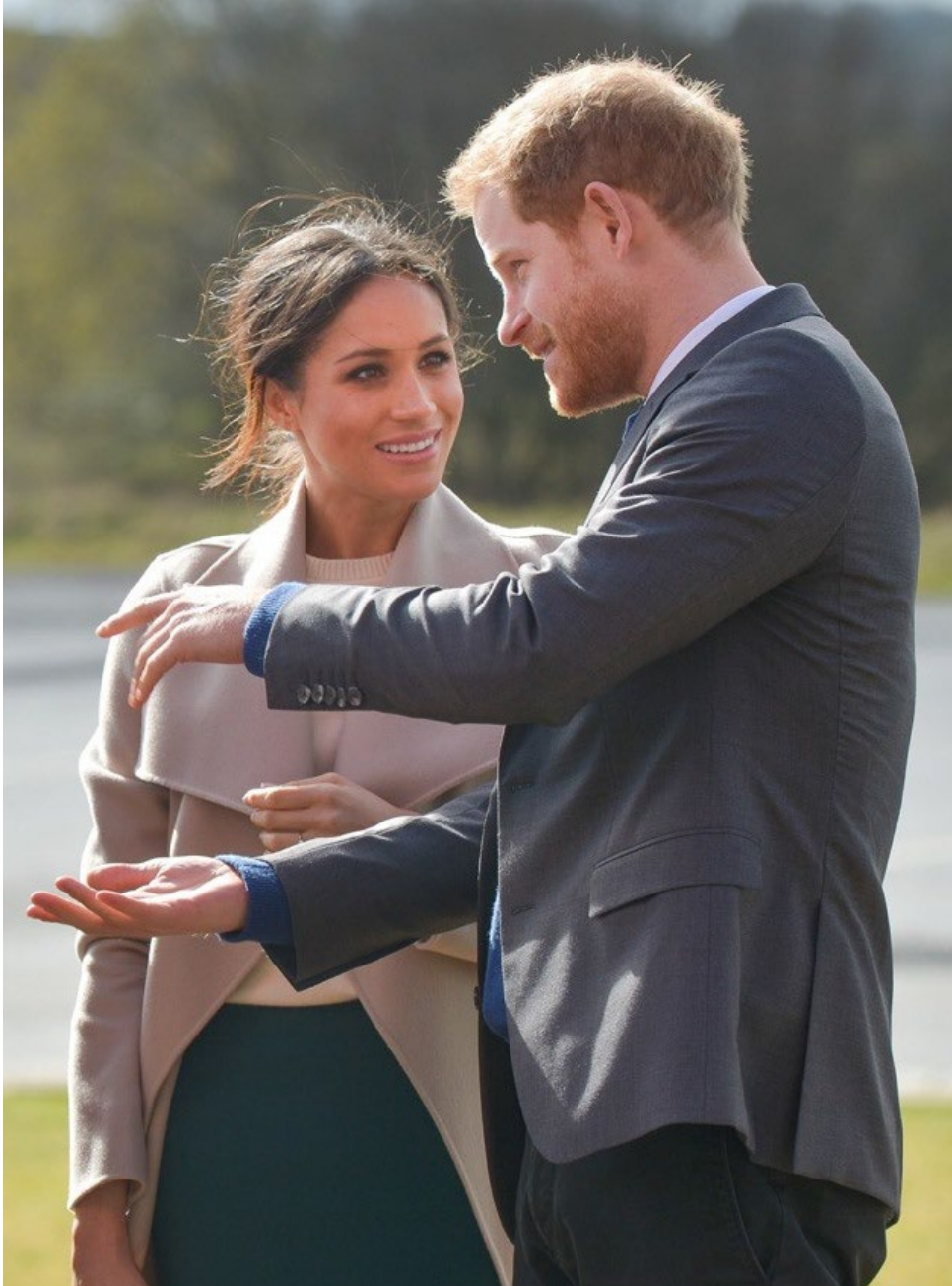
Prince Harry and Ms Markle attend 'Amazing The Space' event.