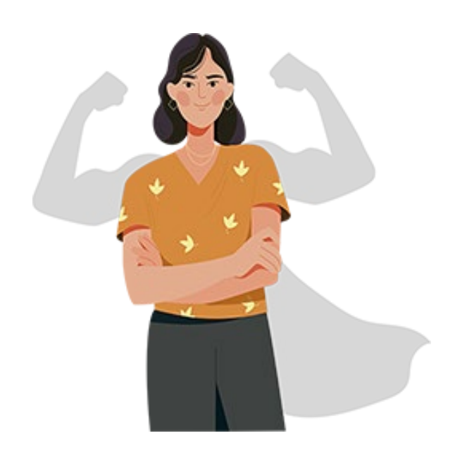
Character is fate. - Heraclitus