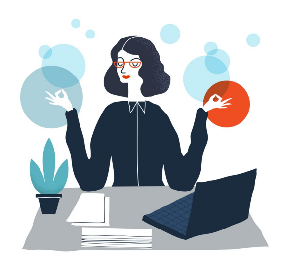
Vocation is the spine of life -Friedrich Nietzsche