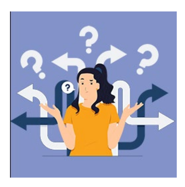
Many are called, few are chosen: many have talent, few have the character that can realise the talent. Character is the mystery, and it is individual. - James Hillman